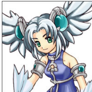
Silwest, the Mana of Air