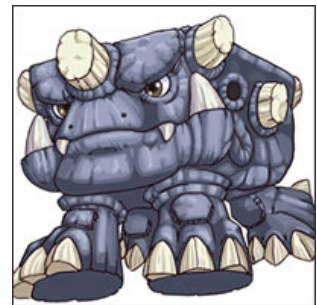
Diemia, the Mana of Stones