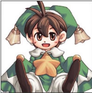
Popo, the Mana of Wood

The world of Regallzine is powered by spirits called Mana. There are wood Mana, air Mana, life Mana and others for a total of 14 Mana. Characters may work with Mana for creating items, spells, and skills to use during the quest.