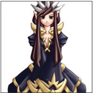
Plua, the Mana of Darkness