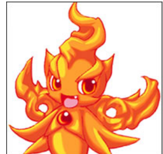
Uru, the Mana of Fire